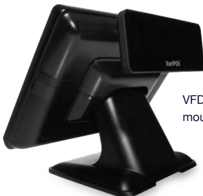
VFD up or down mounted available