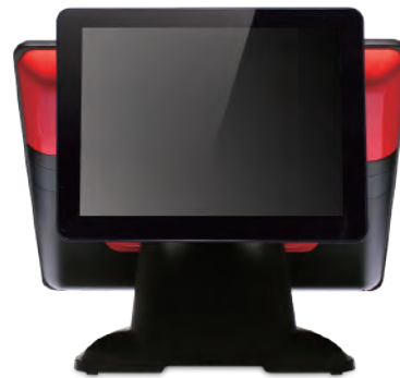
10.4" 2nd display up or down mounted available